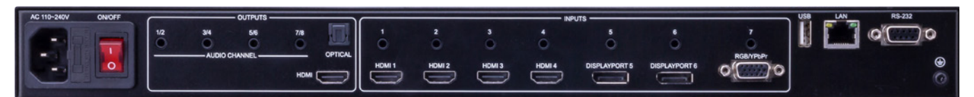
Its deceptively simple appearance disguises its extremely powerful abilities as a 4K Multiviewer / Presentation Switcher.