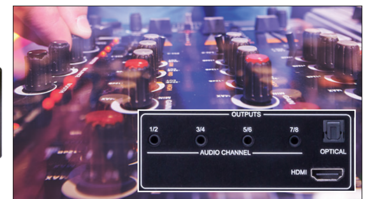
Embed / de-embed any of the 7 audio inputs