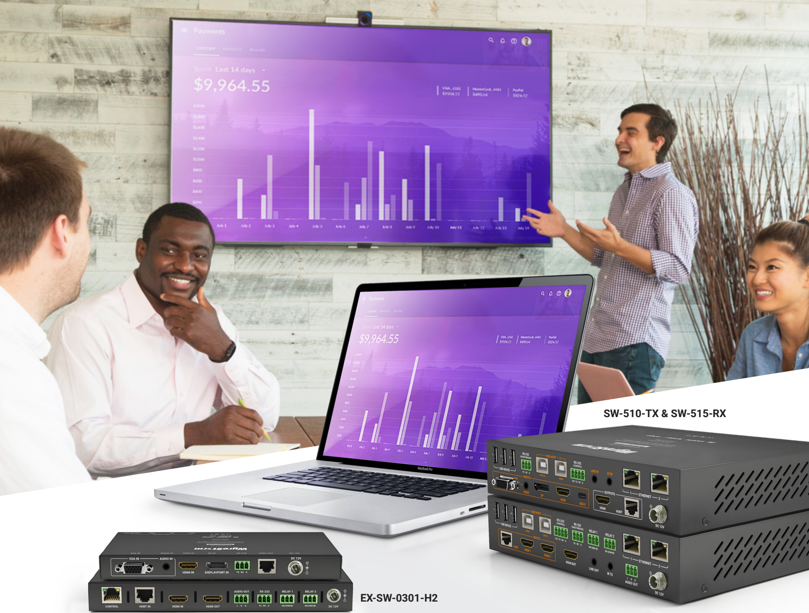
SW-510-TX & SW-515-RX