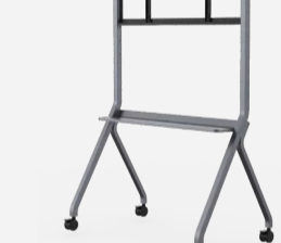
Mobile Stand (ST41B)