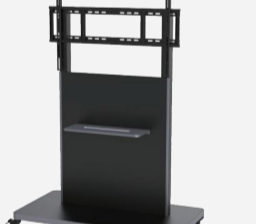
Mobile Stand (ST23C)