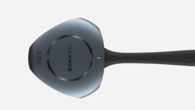
Wireless Dongle (WT13)